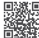
CRICOS 03041M RTO Code 60142

Version 1. Published August 2022. Course information and prices are subject to change.